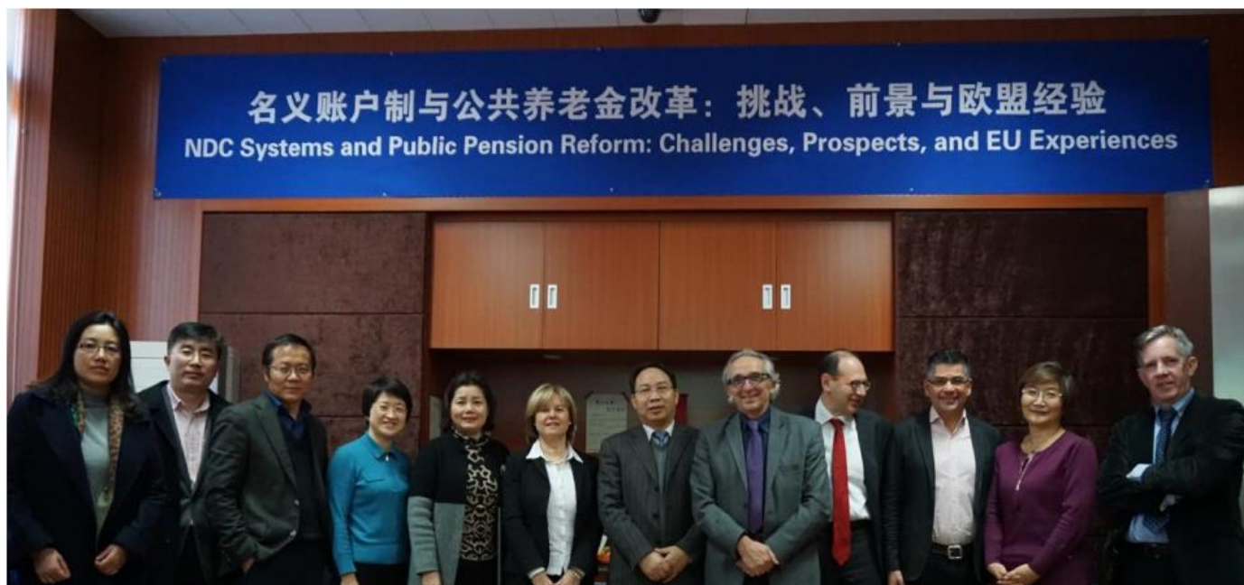
Workshop on NDC Systems and Public Pension Reform: Challenges, Prospects, and EU Experiences held in Beijing on 15 th December 2015 under the Component 2 project scope.

The first part of the report presents a short historical background of the public pension system for urban employees and describes the present