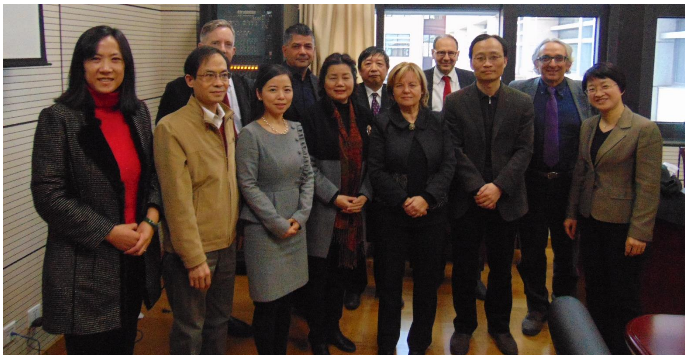
Second Panel Discussion held in Beijing on 16 th December 2015 under the Component 2 project scope.

The Italian Unified Account Statement (UAS) is an instrument that allows obtaining an organic, immediate and progressive representation of a person situation in the social protection system by connecting his essential information, present in a series of archives, The UAS contains both the descriptive elements related to the different segments of his working life and the accounting elements that record the progression of his contributions. The paper also describes the tele-transmission mode of the monthly data of employees (UNIEMENS), that is actually the most effective routine for the implementation of individual personal account; the online service "My Pension", which uses the account statement as a tool of social protection culture and as a solicitation to citizen to think about their future economic situation; the creation of an unified database of all the active workers, thanks to a technological synergy among different