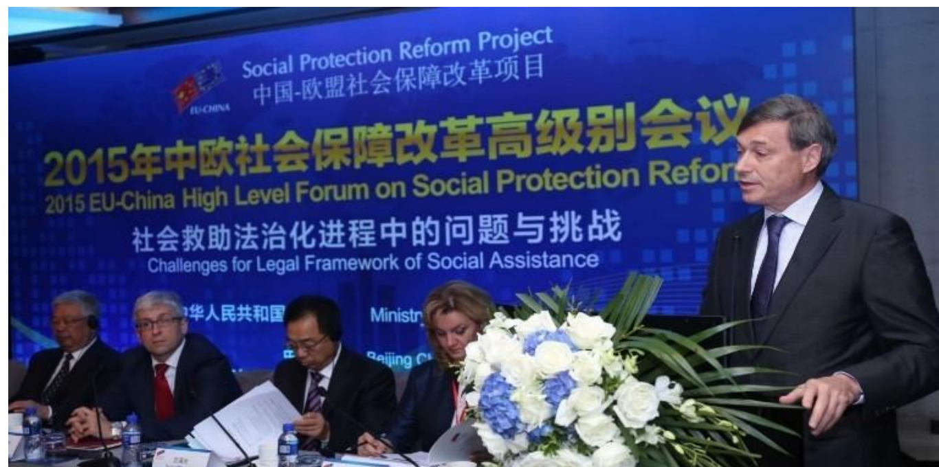
High Level Event on Challenges for Legal Framework of Social Assistance held in Beijing on 15 th and 16 th September 2015 under the Component 3 project scope.

The report focuses on the Minimum Livelihood Guarantee Scheme (MLGS, Dibao, or subsistence allowance) is the core content in Chinese social assistance system, as well as the most important assistance program. Currently, dedicated social assistance benefit largely depends on Dibao entitlement, i.e. if the applicant' family income cannot reach MLGS standard, they will be likely to receive dedicated social assistance in line with their specific needs. The MLGS is an income supplementary assistance system, which makes