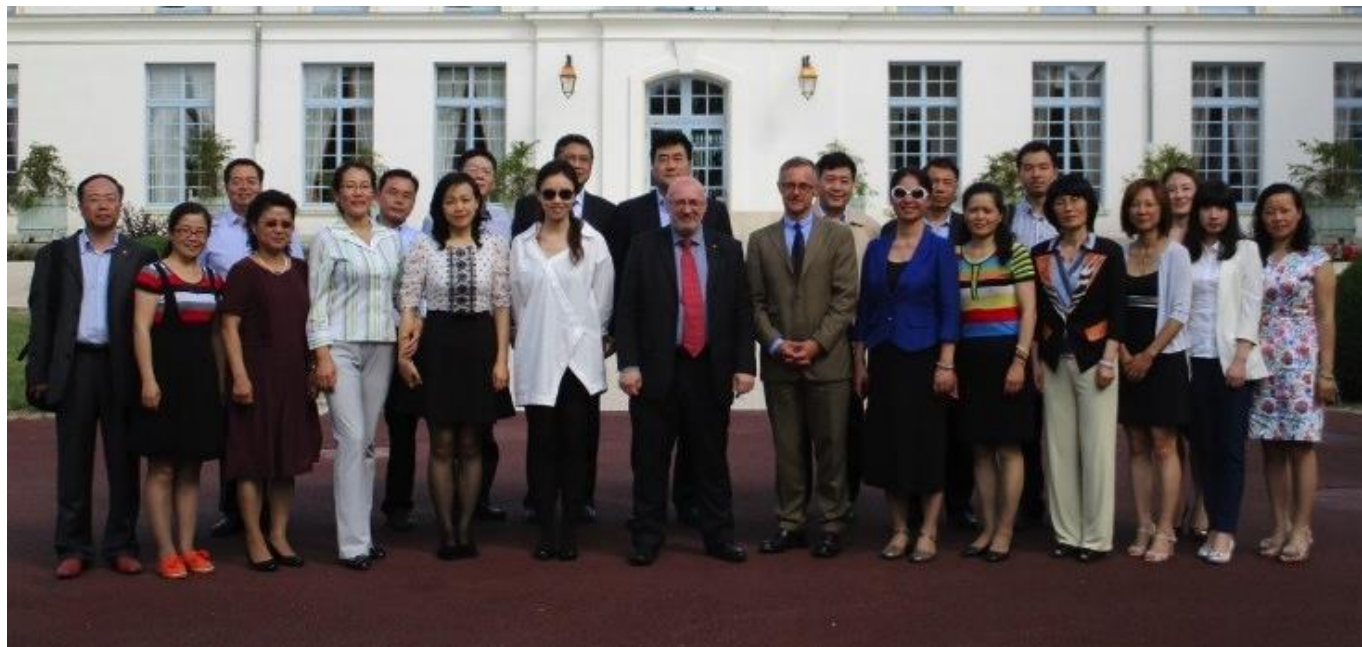
High level training on Multi-tier pension systems in Europe held in France from 21 st June to 4 th July 2015 under Component 1 project scope.

basic pension insurance for urban employees should be planned as a whole in China. The overall planning level of basic pension insurance for urban and rural residents should be raised gradually. (4) To improve the capacity of pension insurance operation management service. Pension insurance operation management regulations should be sorted and operation service resources should be integrated. The construction of basic-level public service platforms should be enhanced. The standardization and normalization of pension insurance service agencies should be facilitated and the agency service for transfer and continuation of urban and rural pension insurance should be normalized. Efforts should be made to enhance social insurance supervision, normalize