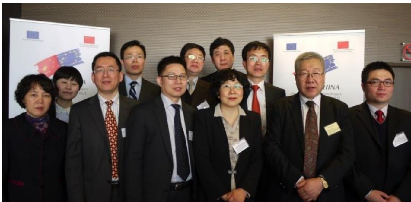
Workshop on Reform of Public Pension Systems held in Brussels on 2 nd and 3 rd February 2015 under the Component 1 project scope.

period. The 13 th Five Year Plan period is a critical stage in reforming the Chinese social security system, and a key period in integrating social security systems for urban and rural residents. Old-age insurance scheme is one of the most important components of China's social security system, and was among the earliest for reform among China's social security programs during China's transition from planned economy to socialist market economy. Although an old-age insurance scheme covering urban and rural areas has been basically established, there are still prominent problems, such as unsound policies and mechanisms, unbalanced development, and unsustainability. Mr. Tan's report puts forward the development targets, reform tasks, measures and suggestions for