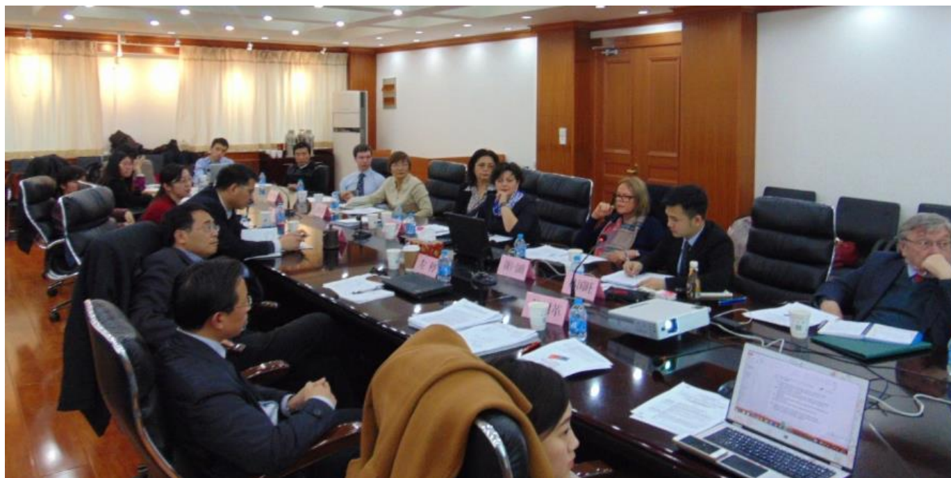
Second Panel Discussion held in Beijing on 4 th December 2015 under the Component 3 project scope.