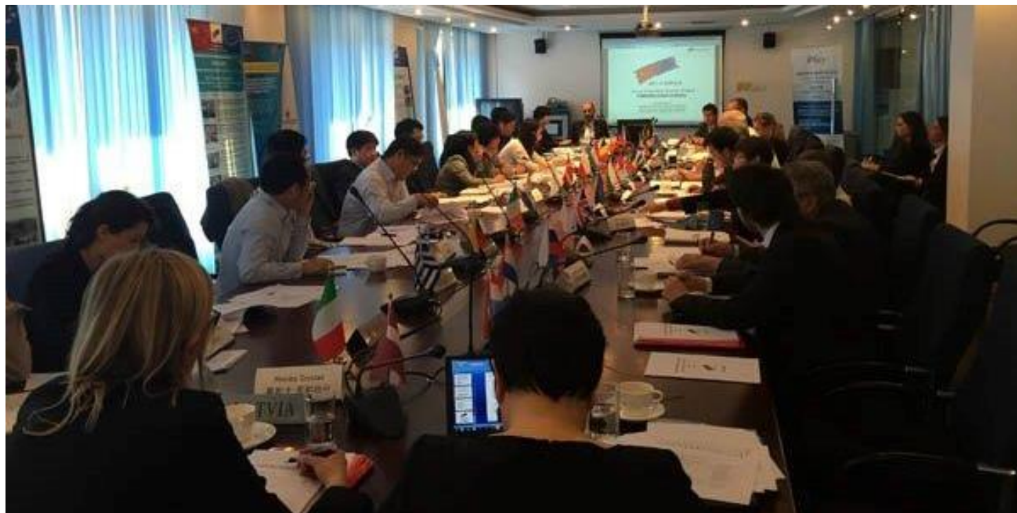
Project Advisory Committee held in Beijing on 21 st April 2015