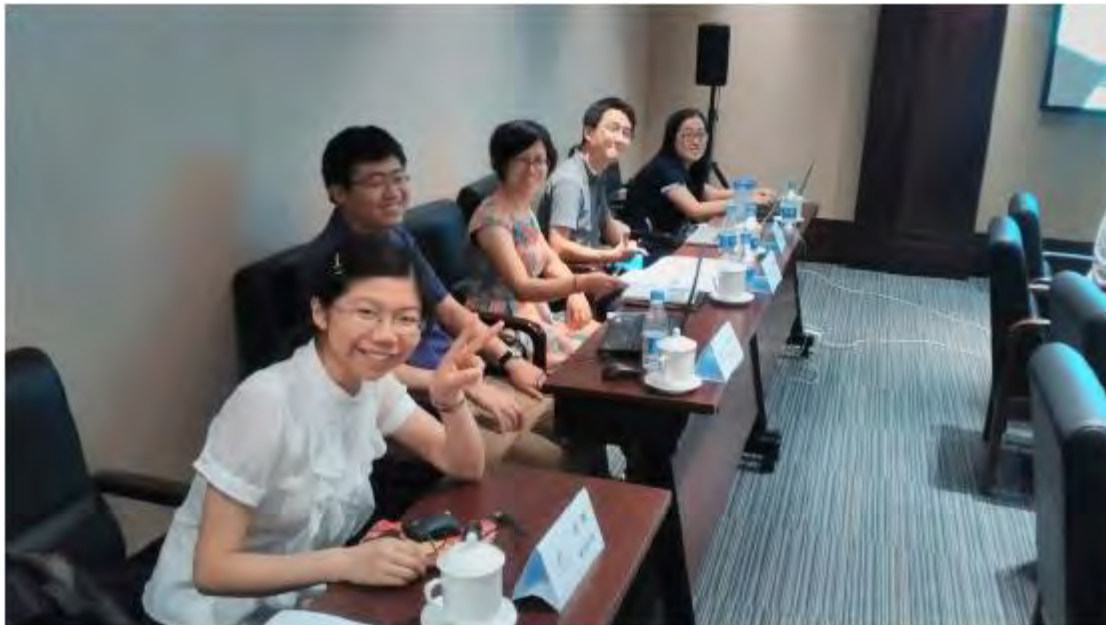
The bench of the assistants ...