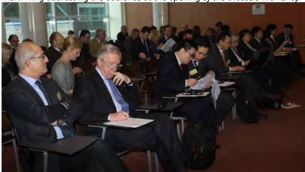
Brussels Workshop – View of delegates during plenary session