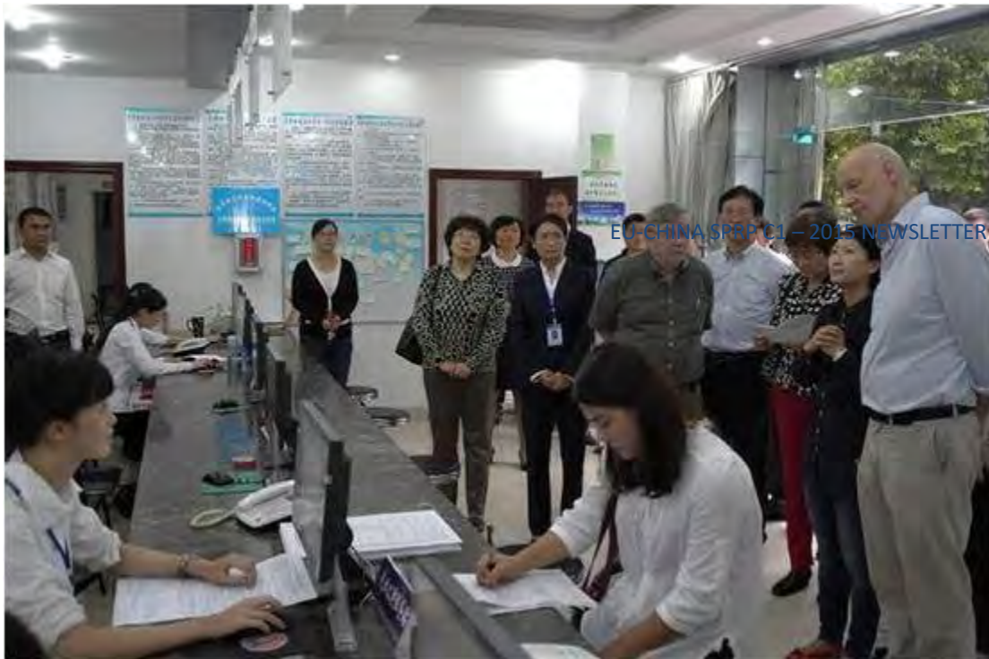
Visiting Social security community center, Luzhou City