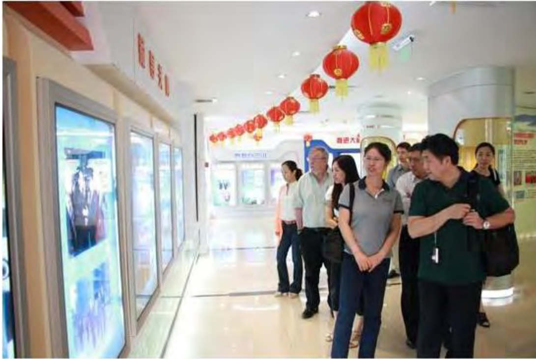
Visiting pharmaceutical company in Huizhou

Not to delay implementation of cooperative activities with the Pilot sites, it was decided by NDRC and the C1 team that the second Panel discussion, dealing inter alia with issues related to migrant workers' social security, would associate representatives from selected pilot sites in Guangdong and Sichuan provinces. It is foreseen that a further training will be provided in situ in February 2016.