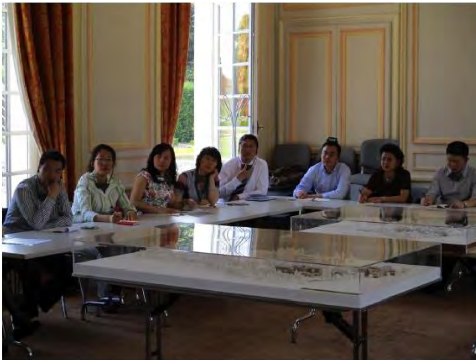
One small group training session

The good organization of the training event, the variety of the topics covered, the high professionalism of the lecturers and the quality of training materials produced were highly appreciated by the participants, who confirmed this exercise would be of great practical value for their work in support of the Chinese social security reform at the central level, or at that of Provincial governments of China. It was noted that this training came at a crucial moment, when critical decisions were in the making concerning the future design of the Chinese pension system. The contribution of the project to enhance the level of understanding of key NDRC officials in European pension theory and practices was therefore highly relevant and deeply appreciated.