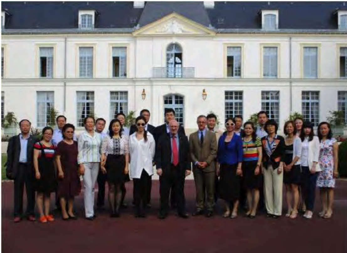
Group picture in front of the MGEN training center