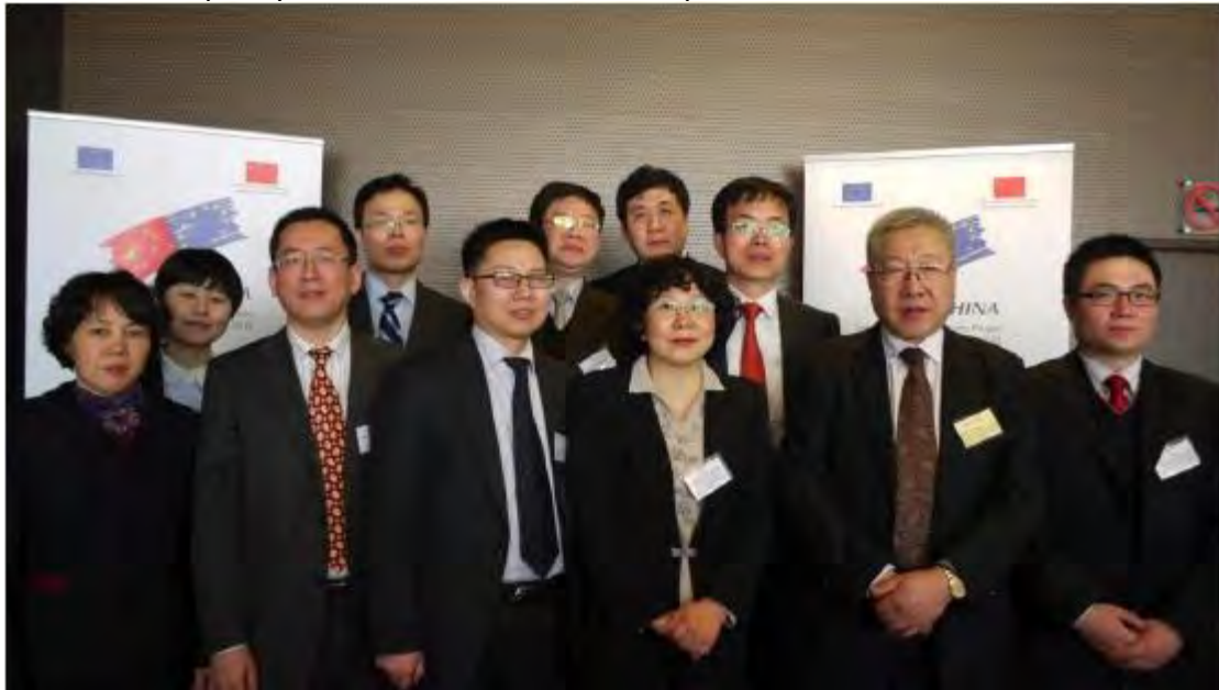
The Chinese delegation at the Brussels Workshop

international reports. The input from non-Consortium member states and representatives from international organizations was particularly appreciated. The perfect organization and the kind hospitality of its Belgian hosts furthermore added to the quality and success of the Workshop.