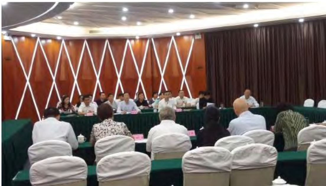
Meeting with City Government officials

Detailed documents expressing the respective provincial fields of interest were subsequently sent to NDRC and shared with the C1 team. Basically, the Provinces request exposure from the project on General introduction to social security policy in the EU, Monitoring and operational systems, Building IT systems for social security and fund raising, Vesting and portability of social security rights for migrant workers. They requested that knowledge sharing take the form of capacity building either in-country or abroad.