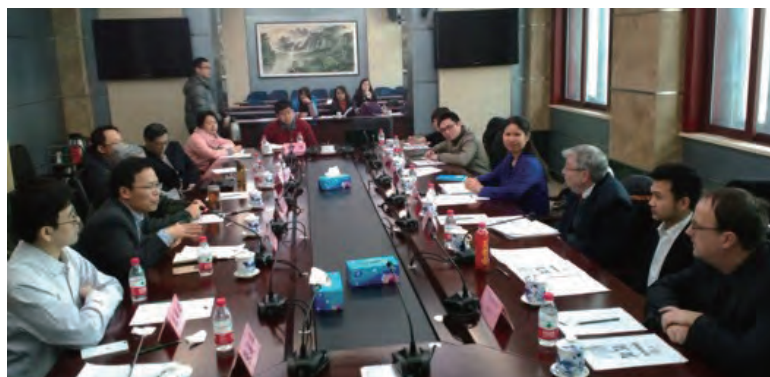
Seminar on Crisis and Social Security hosted by CASS