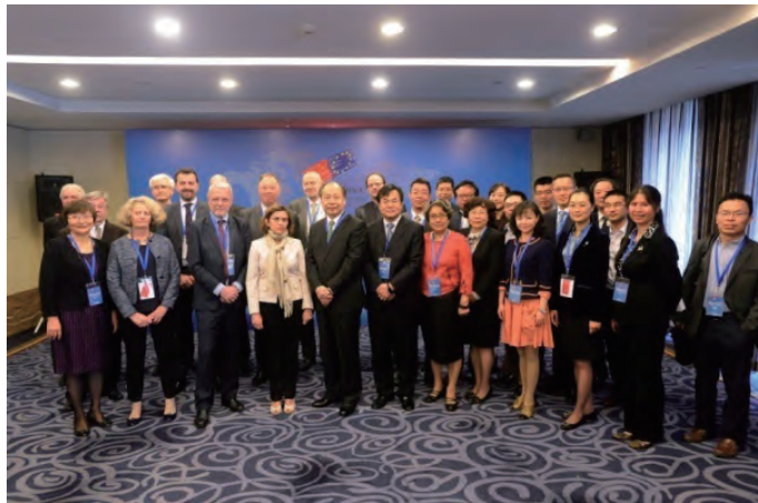
Participants of Policy Dialogue and International Workshop