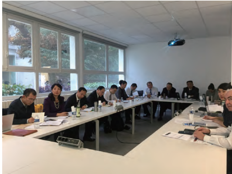
NDRC delegation had meeting in the Ministry of Health and Social Affairs of France, joined by the representatives from Project's pilot sites Sichuan Province and Guandong Province.

From October 24 to 29, 2016, NDRC conducted a study visit to France and the Czech Republic on the theme of the reform, modernisation and coordination of social security schemes, with special reference to migrant workers and computerisation. In France, the delegation met with the Ministry of Health and Social Affairs, Pensions Advisory Board, CLEISS (the national liaison body for migrant workers' social security rights), National Pensions Information Technology Center, etc. In the Czech Republic, the delegation held discussions with the Ministry of Labor and Social Affairs and Social Security Administration. After finished the study visit and dialogue, the NDRC delegation continued its trip to Germany until November 2, where the representatives held discussions with the Rhein-Bonn-Sieg University concerning the organisation of a training course in 2017 under Component 1 framework of activities.