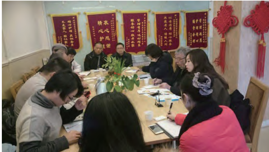
Visited a care centre for elderly at Yangjin Community, Pudong

From 1 to 3 February 2016, a project mission composed of representatives from NDRC and from Component 1 technical team visited Shanghai, a city selected as pilot site for issues related to demographic ageing and social protection. Accompanied by members of Shanghai Development and Reform Commission, the mission visited several institutions specialized in social and medical care for the elderly. It conducted useful exchanges with local authorities.