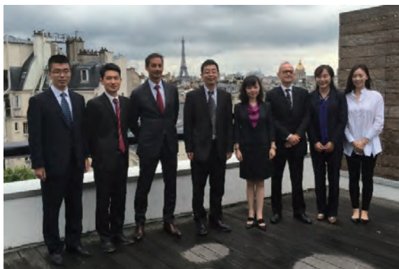
Chinese delegation with officials from Expertise France on EF office in Paris

September 2016 for a Dialogue and Study Visit on the Influence of Employment and Social Security Policies on Income Distribution in Post-Crisis Era. In Paris, the delegation met with representatives from Ministry of Labour, Employment, Vocational Training and Social Dialogue, France Stratégie, as well as National Employment Public Service. They also held discussions with Expertise France on forthcoming activities. In Brussels, the delegation had in-depth discussions with eminent specialists from Belgium, Germany, OECD and European institutions organized by the Federal Public Services Social Security of Belgium. The delegation also visited the European Commission to meet with relevant officials from DG Employment, Social Affairs and Inclusion to discuss the perspective and implementation of next-step cooperation with EU in terms of optimizing the structure of income distribution and increasing the number of middle class.