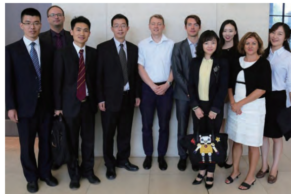
Chinese delegation at the Federal Public Services Social Security of Belgium