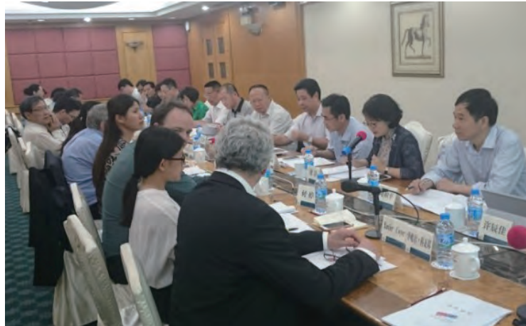
Training in Foshan, Guangdong Province.