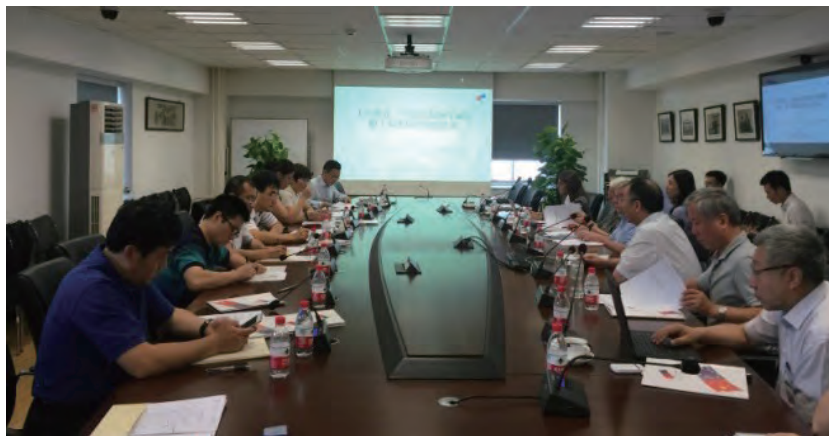
Panel Discussion held in Beijing