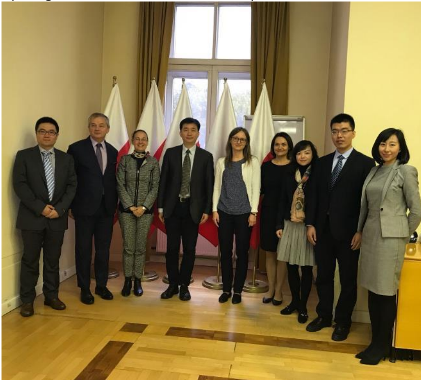
In Krakow the delegation meets with municipal authorities