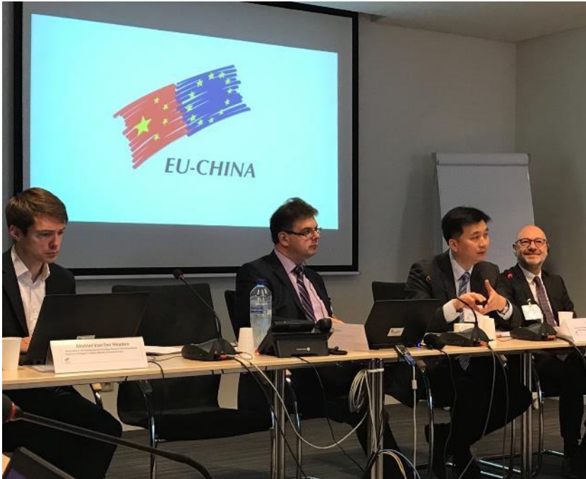
Opening session of international workshop in Brussels

In Denmark, the Delegation had bilateral discussions with the Ministry of Employment on Danish Active Labour Market Policies. It also had a working session with the Danish Confederation of Trade Unions L.O. In Poland, the delegation met in Warsaw with the Ministry of Family, Labour and Social Affairs to discuss relevant policy issues. It also visited a number of ground institutions active in the implementation of Polish labour market policies in Krakow and in Warsaw.