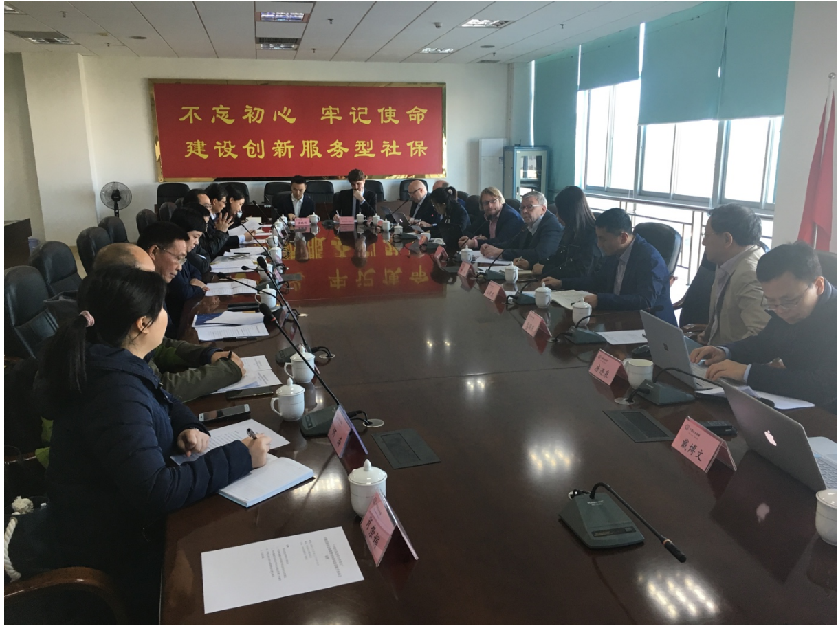
Plenary meeting in Huizhou