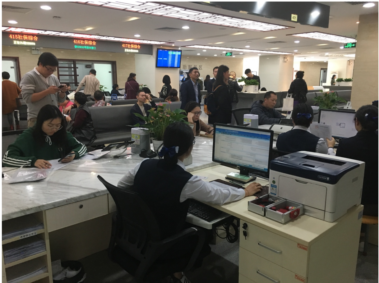
Visiting a center for public services