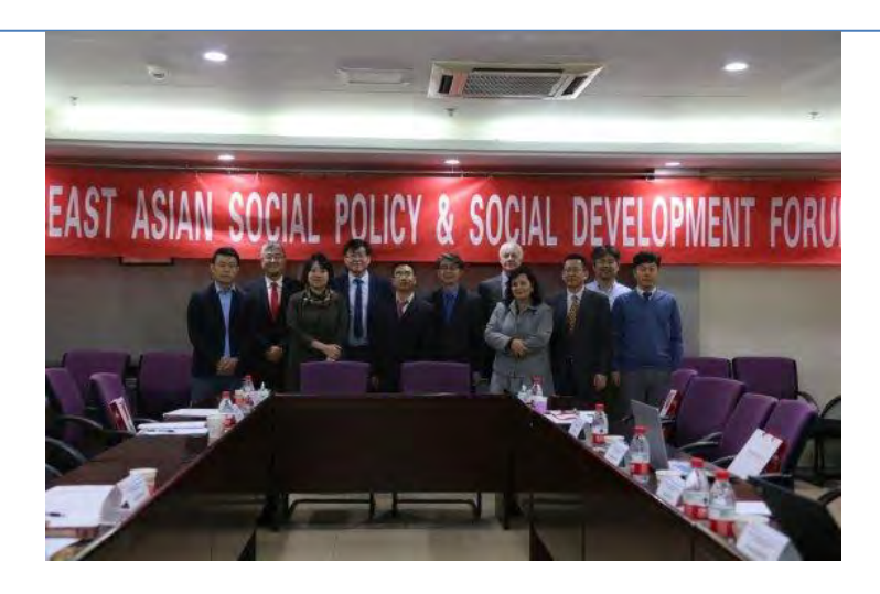
Social Assistance Comprehensive Reform Pilot Area Exchange Conference -