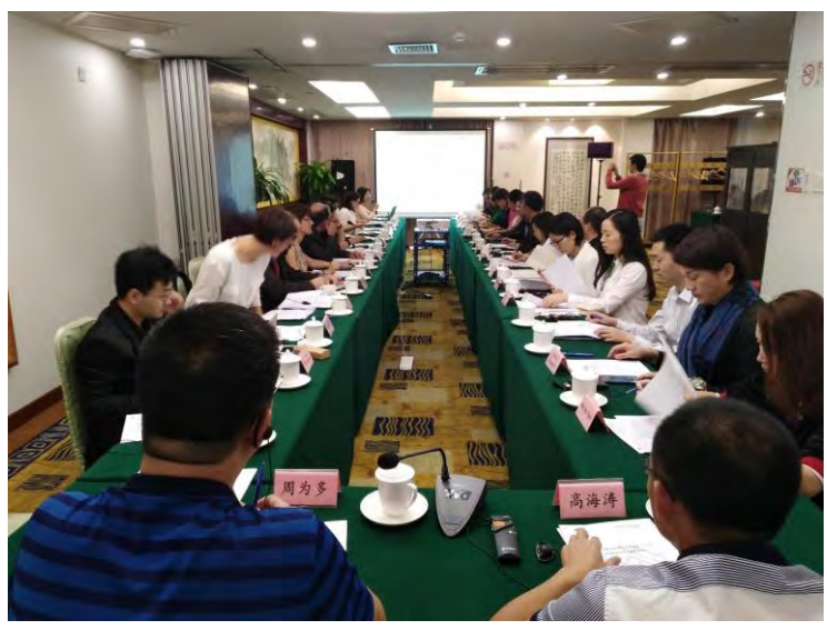
2018 - Training session for C3 pilot sites MoCA staff, Beijing, September 25th, 2018

Continuing the EU-China exchanges on practices and knowledge in the field of social assistance a training session for local staff implementing C3 pilots was organized.